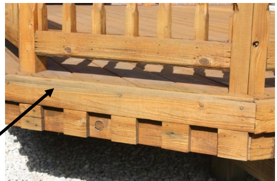
Dental molding not required