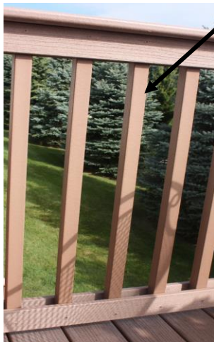
Spindles may be fluted or squared