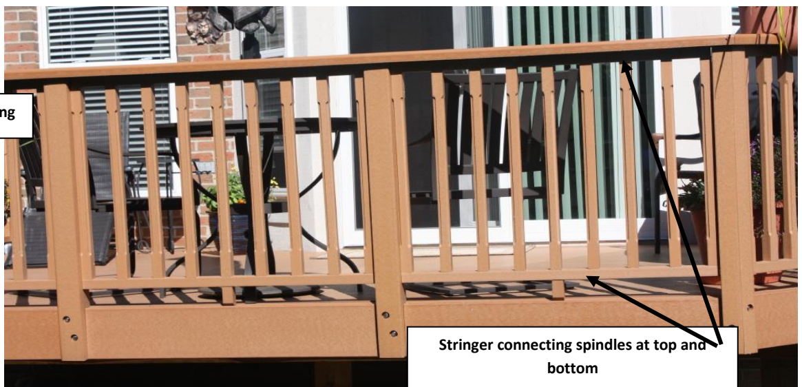
Flat top railing